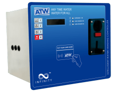
ATW Card & Coin Wending Machine