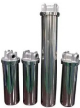
SS Filter Housing