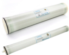
RO Membrane OVAY