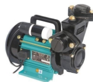
Feed Pump LUBI