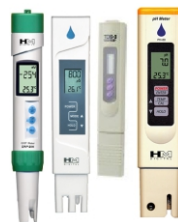
TDS & PH Meter HM