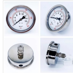
Pressure Gauge USS