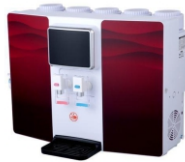
Hot & Cold RO