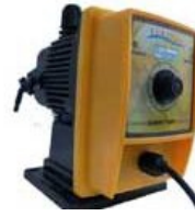
Dosing Pump 6-10 LPH