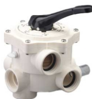
Multiport Valves GUDDI