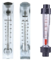
Flow Meter USS