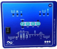
RO Control Panel INFINITY