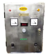
Ozonators SS PLASTCO