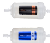
UV Filter 4"