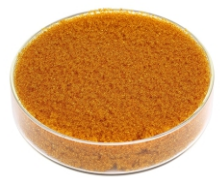
Doshi ION Resin