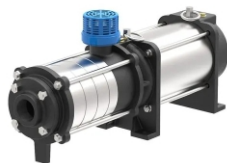
SS Transfer Pump LUBI