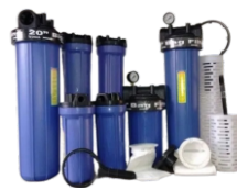
Bag Filter Housing