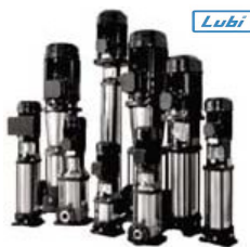
High Pressure Pumps LUBI