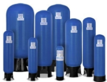
FRP Vessels TATA & ALFA

PLASTCO Industries AN ISO 9001 : 2008 CERTIFIED COMPANY