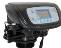
Auto MPV RUNXIN