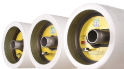
FRP Membrane Housing UKL