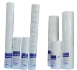
Spun & Wound Cartridge PLASTCO