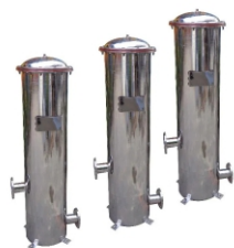
SS Filter Housing