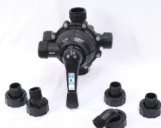
Multiport Valves PLASTCO