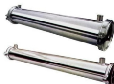
SS Membrane Housing USS