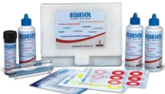
Water Testing Kit AQUASOL