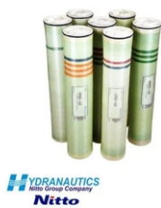
RO Membrane CPA 3 & 5