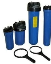
Jumbo & Slim Housing Blue