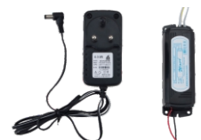
UV Choke & SMPS